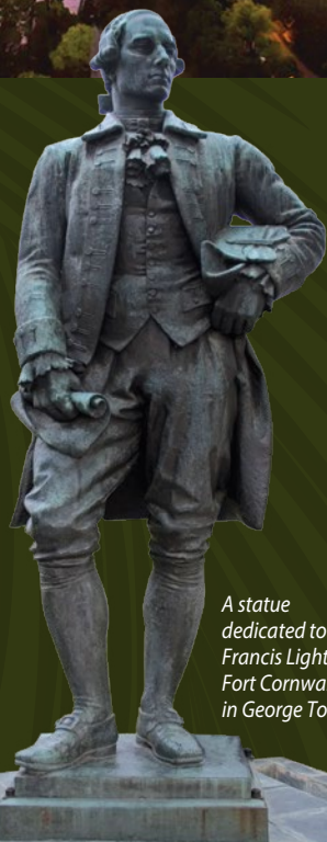
A statue dedicated to Sir Francis Light at Fort Cornwallis in George Town