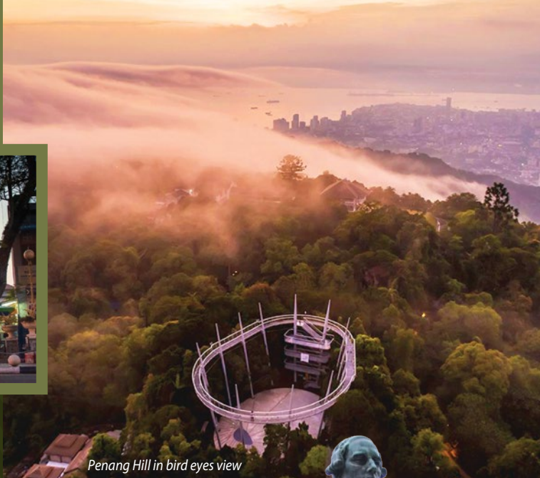
Penang Hill in bird eyes view

For a breath of fresh air, head to the Penang Botanic Gardens, fondly known as the "Waterfall Gardens". Discover a wide variety of flora and fauna, wander along leafy trails (keep a lookout for monkeys!), and enjoy the peaceful surroundings. Or take the scenic train ride up Penang Hill for panoramic views and cool breezes. At the top, explore The Habitat; a rainforest discovery park offering treetop walks, canopy bridges, and stunning sunset vistas. (Fun Fact: The park is a part of the UNESCO Penang Hill Biosphere Reserve, which spans 12,481 hectares of protected marine and terrestrial ecosystems). For nature lovers, trek through Penang National Park in Teluk Bahang—its trails lead to pristine beaches like Pantai Kerachut and the Muka Head Lighthouse.