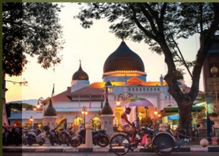
Kapitan Mosque at Street of Harmony